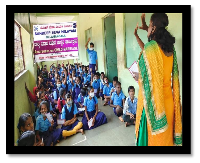
Awareness on Child marriage and Missing children for the School Children supported by NESS TECHNOLOGIES INDIA PVT.LTD.

Registered Office Address: Sandeep Seva Nilayam Near Benaka Layout, Obanayakanahalli Road, Nelamangala Bangalore Rural Dist.562123